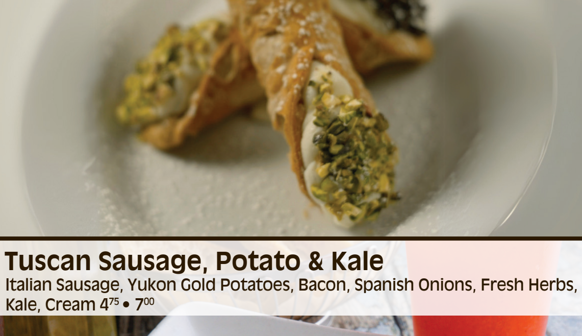
Chef's Featured Soup Available 4/15 - 4/30